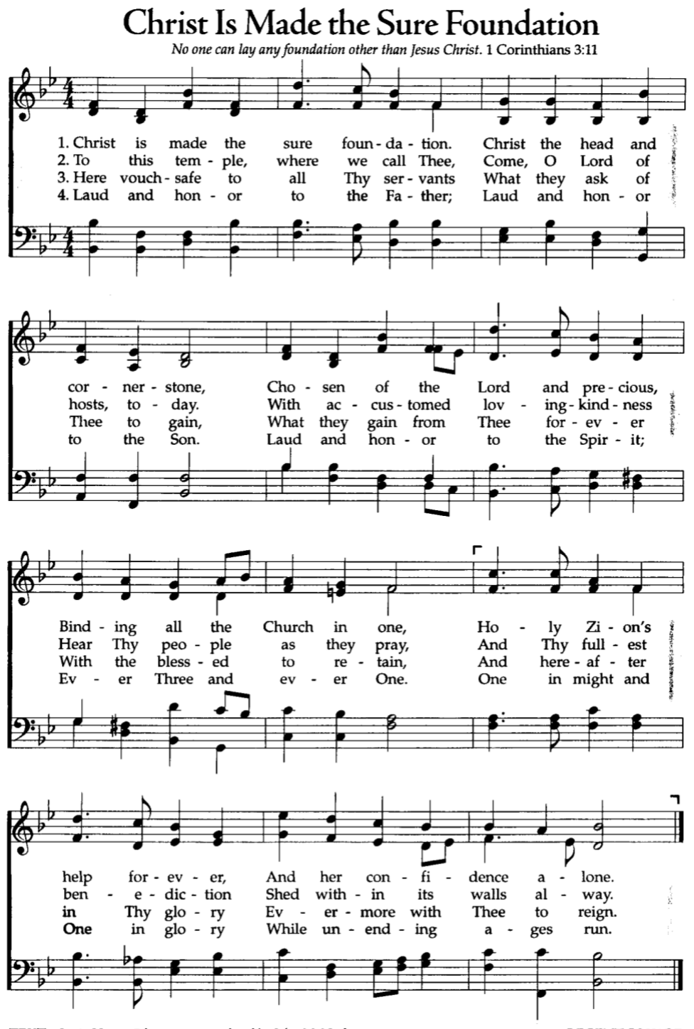
TEXT: Latin Hymn, 7th century; translated by John M. Neale MUSIC: Henry T. Smart