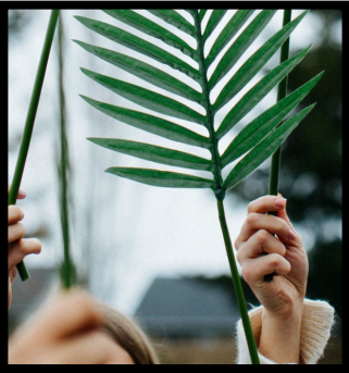
PALM SUNDAY April 13 | 9:30am