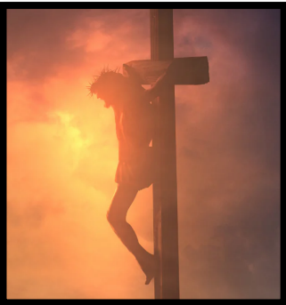
GOOD FRIDAY April 18 | 7:00pm