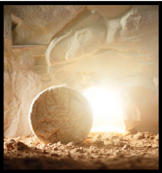
EASTER SUNDAY April 20 | 9:30am