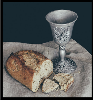
MAUNDY THURSDAY April 17 | 7:00pm